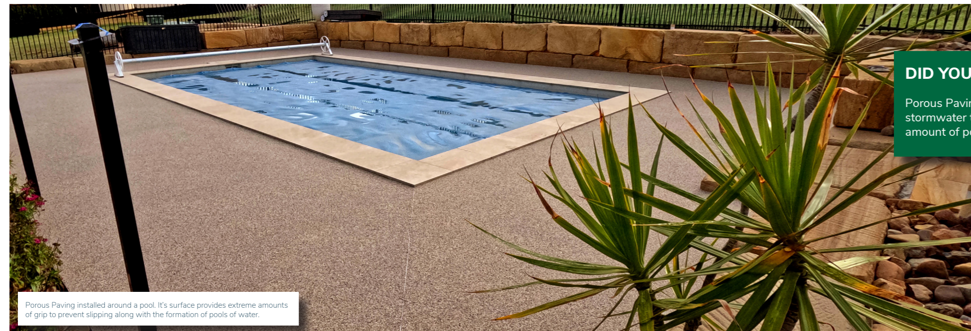
Porous Paving installed around a pool. It's surface provides extreme amounts of grip to prevent slipping along with the formation of pools of water.