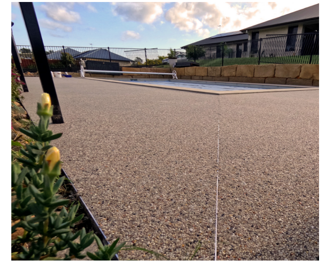
Pool surround with Porous Paving installed. This material allows liquids to freely flow through it, providing a fantastic solution to prevent puddles from forming.

Porous Paving also offers several massive advantages over regular tiling when it comes to pool surrounds. Porous materials have substantially higher grip than regular tiles or non-permeable materials, even when wet, which makes it perfect for keeping others safe by preventing slipping. This added safety feature is especially important for households with children or elderly residents who are more prone to falls.