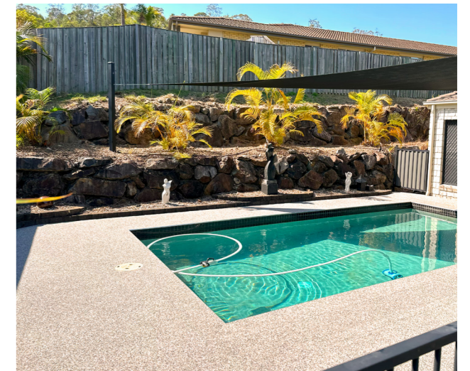
Porous Paving's anti-slip surface is a fantastic choice when children and the elderly are enjoying themselves by the pool without having to fear slipping.

DID YOU KNOW? Porous Paving help reduce runoff during the rain season by allowing stormwater to be absorbed into the ground supply. This helps reduce the amount of polutants that end up being swept into our waterways.